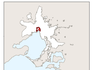
Part of Planning Scheme Map 8HO1